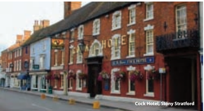
Cock Hotel, Stony Stratford

From Calverton in the west of the city area to New Bradwell and Great Linford in the north explored via the Railway Walk, hidden heritage buildings and sites abound. From here moving north beyond the Ouse Valley is the rural north west and the villages of Haversham, Little Linford, Castlethorpe and Hanslope.