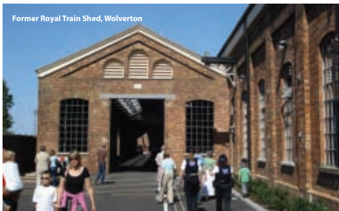
Former Royal Train Shed, Wolverton

The success of Heritage Open Days every second weekend in September in now regularly holding fifty FREE events, has encouraged organisations to come together more times in the year. Milton Keynes Council is co-ordinating this new Heritage Events calendar, which will provide significant event weekends, with exhibitions and activities for the public. www.milton-keynes.gov.uk/heritage