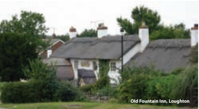
Old Fountain Inn, Loughton

Just outside the city centre lie some of the prettiest local villages. In the east lie Milton Keynes Village, which gave the city its name, Broughton, Willen and the Woolstones connected by the Ouzel Valley with churches, medieval buildings and manors, whilst to the west lies Loughton, with its historic inns on Watling Street.