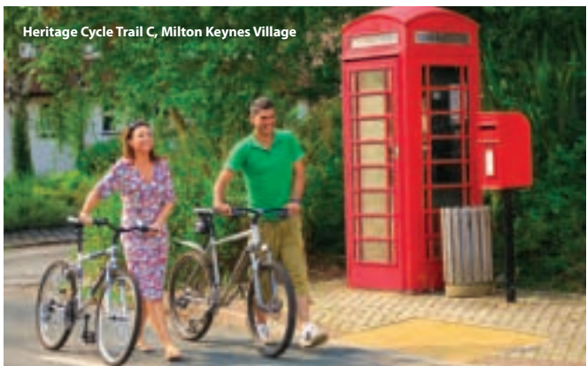
Heritage Cycle Trail C, Milton Keynes Village