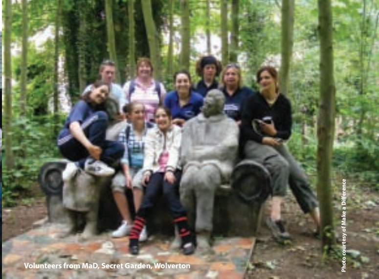
Volunteers from MaD, Secret Garden, Wolverton