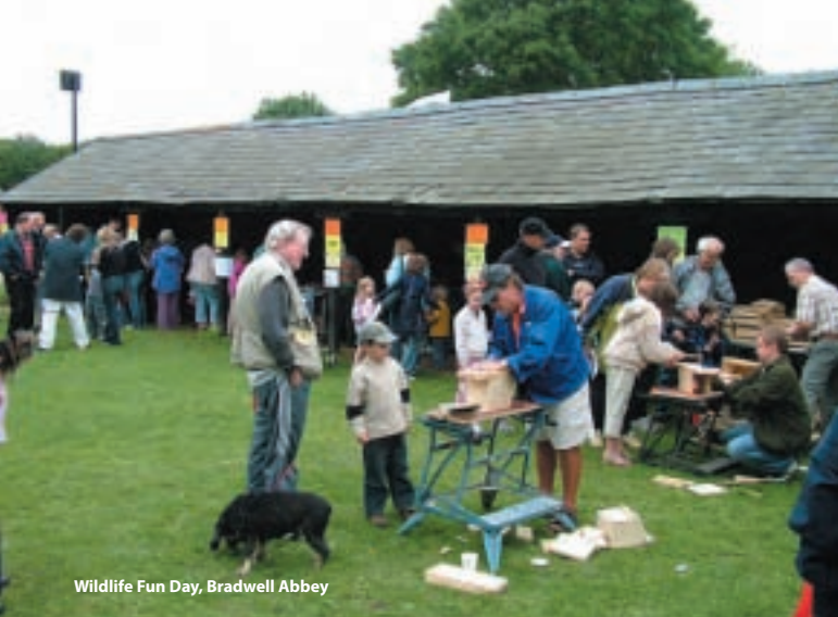
Wildlife Fun Day, Bradwell Abbey