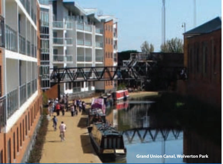
Grand Union Canal, Wolverton Park