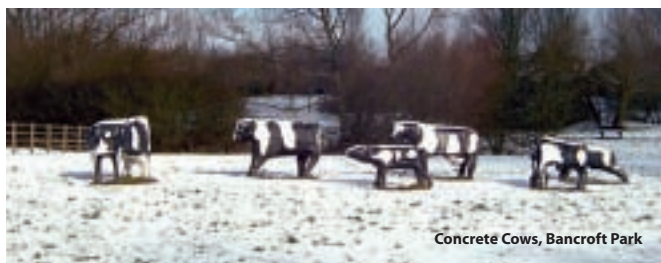
Concrete Cows, Bancroft Park