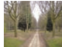
Cathedral of Trees

Cathedral of Trees The arching branches of woodland trees evoke the image and character of medieval gothic architecture. This 'cathedral' is based on the plan of Norwich Cathedral and different tree species are used to create its character.