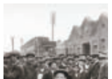
Wolverton Works (c1920)

Wolverton railway station/depot was the reason for the development of Wolverton as a planned town in the 1830s. Halfway between London & Birmingham it was ideal for the servicing and refuelling of locomotives. Supplies to build the new railway town were transported by barge.