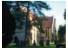
St George's Church

St George The Martyr Church in Wolverton, was built by the London & Birmingham Railway Company in 1843 for the special, but not exclusive, use of railway workers. The first church in the world to be built by a Railway company.