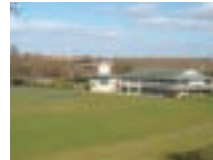
Pavilion and Cricket Pitch