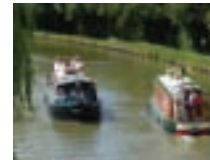
Grand Union Canal

The Grand Union Canal winds its way through Milton Keynes creating a haven of tranquillity. Canal boats first travelled from London to Birmingham, through what is now Milton Keynes, in 1805. The Canal prospered until 1838, when the London to Birmingham Railway opened and took away a great deal of trade.