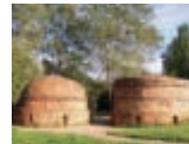
Price's Brick Kilns