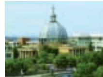
Christ the Cornerstone

City Church (Christ the Cornerstone) was opened in 1992 as the first ecumenical city centre church in the United Kingdom. The Church has excellent acoustics and is a wonderful setting to hear live music.