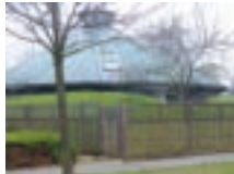
Eco Home Round House

Energy World (1986) was a pioneering construction project of 51 low-energy houses in the Shenley Lodge area. You can still see the Eco Home Round House, an unusual house with insulating earth banks and two-storey conservatory as well as the Solar Clock and Javelin Sundial.