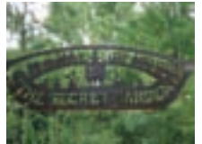
The Secret Garden

The Secret Garden was formerly occupied by four 'villas' built by the London & Birmingham Railway Company in the 1840s. Demolished in the late 1960s the area has been developed into a community garden, opened in 2005.